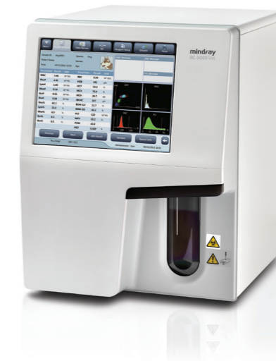
BC-5000 Vet Auto Hematology Analyzer